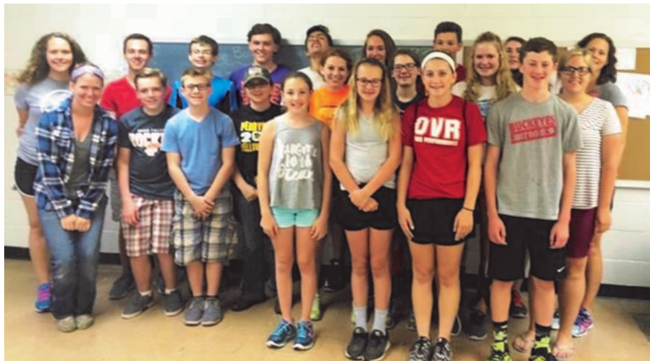
Zoar Youth along with youth from St. Mark's, BG and Epiphany Lutheran Church at Summer in the City.