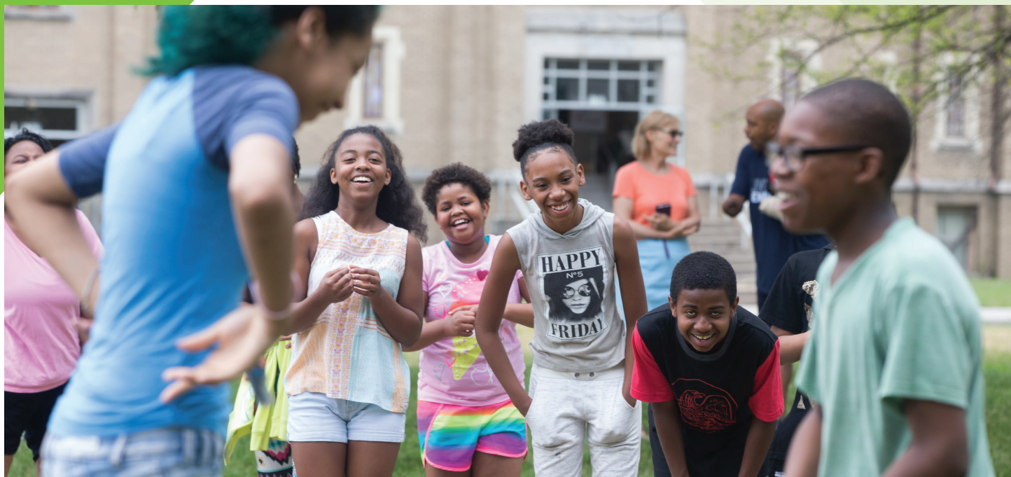
Redeemer Summer Youth Program 2017