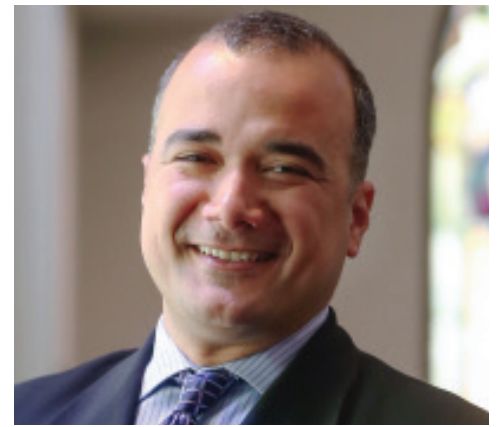
from Omaldo Cantor