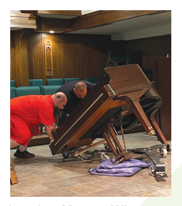
The new Yamaha S6X Grand Piano was delivered on Wednesday, May 18. What a blessing to the music program at Zoar Lutheran Church!

I am very grateful for the blessing of the new Yamaha S6X Grand Piano that arrived at Zoar Lutheran Church on Wednesday, May 18, 2022. I want to share the story of how this all came to be and how we came to select it, mainly because this piano, much like our organ, is a legacy instrument. The piano will continue to enhance our worship services and concerts for years to come. It's a blessing to generations of Zoar members and the community of Perrysburg.