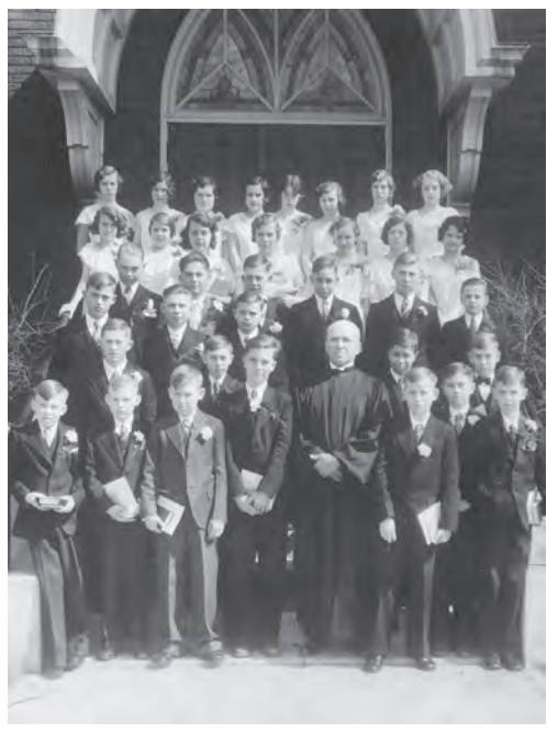
Confirmation class from 1932 on the stairs outside at Zoar.

As Catechism classes begin for 2022-2023, the Heritage Committee would like to share a few items and memories of past Confirmations at Zoar Lutheran Church. These precious items, along with many other books, photos and materials can be found in the Archive Room.