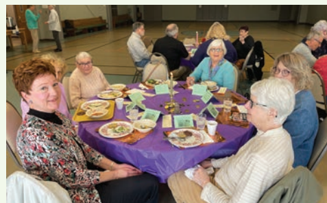
Zoar members and friends enjoying a delicious meal and time in fellowship.