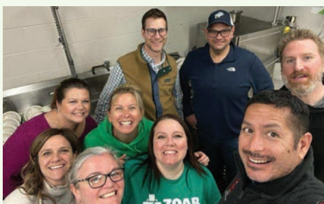
Young Adults Small Groups leaders prepared one of the Lenten meals. Look at those happy faces!!