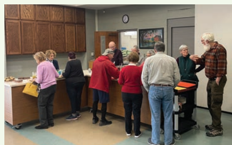
We are so thankful for the many groups, committees and Church Council for providing and serving meals.