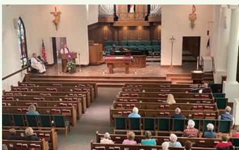
Members and friends of Zoar enjoying one of the Midweek Services.