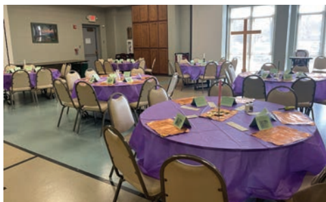
Thank you to the team who decorated the tables each meal! It was lovely!

We hope you were able to join us at one (or more!) of our Lent Midweek Services and Meals & Conversation! We had great participation with the book study Meeting Jesus at the Table . Here are some highlights: