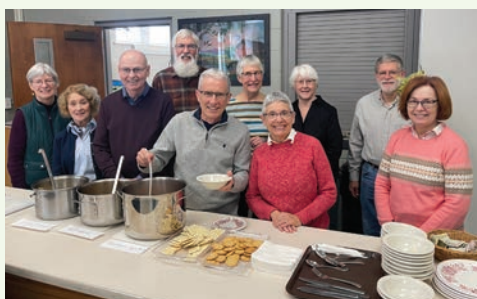
The Wednesday Morning Bible Study group prepared a yummy meal of soups, salads and desserts!